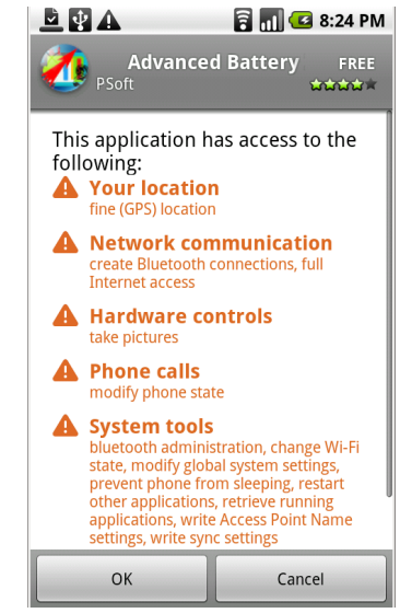
Fig. 1. Android permission prompt during application install Why does a Battery application require so many invasive permissions?

First we discuss Android's permission model in section II. In section III we describe the inner workings of the Permission Check Tool. Finally we present related work in section IV and have a concluding discussion providing some avenues for future work in section V.