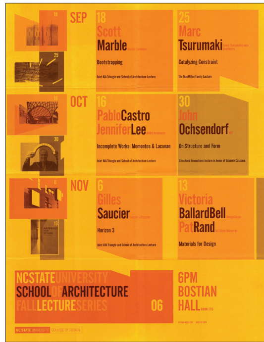
FALL 2006 NORTH CAROLINA STATE SCHOOL OF ARCHITECTURE LECTURE SERIES