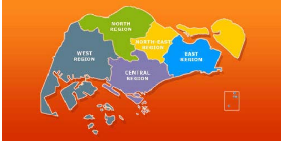
Figure 2: Geographical Map of the Five Planning Regions in Singapore