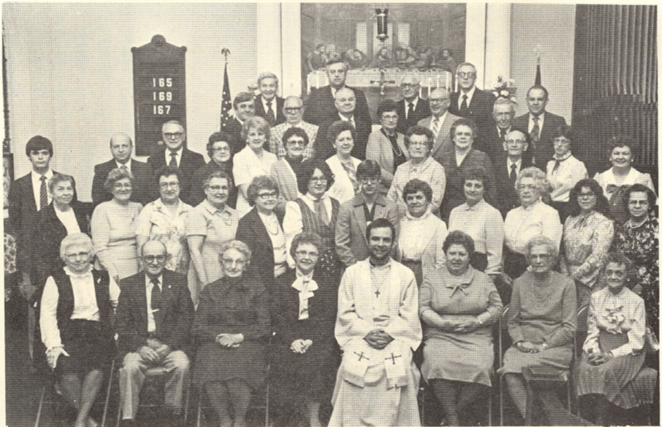
CONGREGATIONAL PICTURE OF 1983