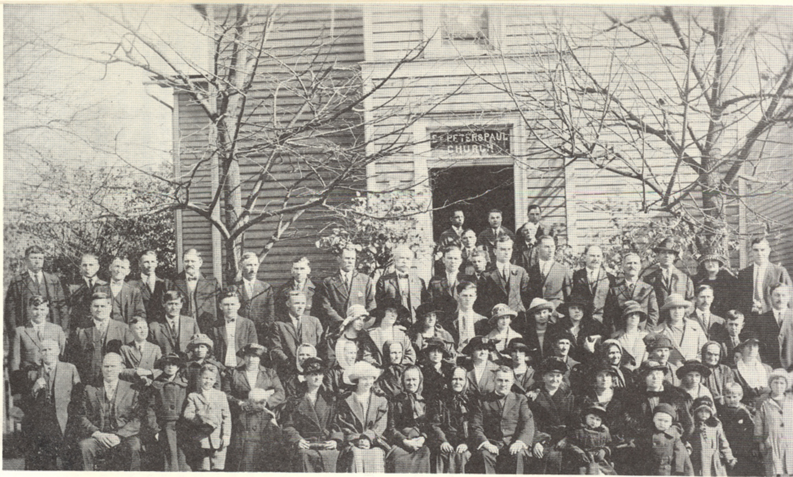
CONGREGATIONAL PICTURE OF 1922